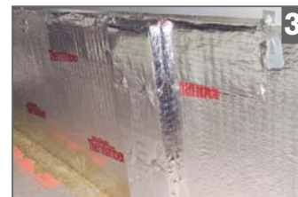
Tape over all spiral anchors to restore vapor barrier with Thermafiber® Aluminum Foil or FSK tape.